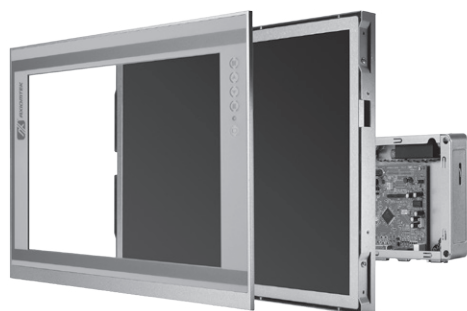
▲ Modularized design